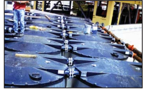
Ice Storage Tank Farm

Thermal energy storage systems provide the means of shifting full or partial HVAC electrical load from peak day-time use to off-peak hours. The choice of which strategy to use depends on the utility rate structure. At Ala Moana, for instance, the chillers, cooling tower and condenser water pumps are on a separate off-peak rate structure that makes it favorable to use storage system shifting.