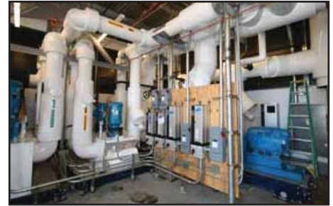
Circulating Pump at Ala Moana