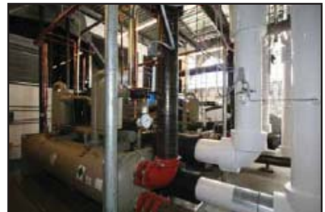
Chillers at Ala Moana