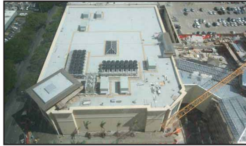
Nordstrom - Ala Moana rooftop tank farm and air handlers

Relative to environments the HVAC systems for this outstanding facility have been designed to maintain the same high standards expected of mainland stores while being a good neighbor environmentally. One of the challenges of this application was to provide a high-comfort mechanical system, minimize utility system infrastructure needs and simultaneously create a small environmental footprint. Daytime power costs on the islands are quite high, set to encourage off-hour consumption. To minimize the consumption of daytime electricity, a full thermal ice storage system was employed. The system uses off-peak power to cool a storage medium; in this case, ice. Off-peak power is provided at a significant reduction in cost to the consumer and helps the utility balance off-peak and on-peak power requirements, avoiding increased infrastructure costs. The ice inventory is built using low-temperature chillers circulating a brine solution through water-filled tanks. Each tank is rated at approximately 186 ton-hours of capacity. A total of 48 tanks were used, providing 8,967 ton-hours of capacity. The reference to "full-storage" (as opposed to "partial-storage") refers to the system's ability to create and store enough ice to satisfy a full day's cooling needs without energizing mechanical refrigeration systems.